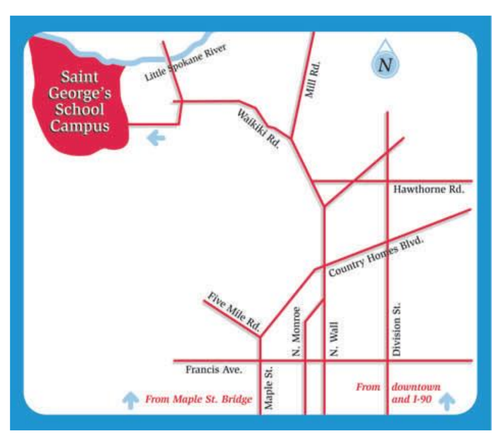
Map to Saint George's School campus

While continuing to stay in the left lane, follow Waikiki down a long hill, and at the bottom of this hill, you will come to a roundabout. Take your second right to stay on Waikiki. (If you find yourself on Mill Road, turn around and head south until you can get back to Waikiki.) Follow Waikiki past the Spokane Country Club (on your right), the road winds down past the golf course and approximately ¾ mile beyond the entrance to the Club sign is the entrance to the school. You will come upon a red Saint George's School sign. Turn and bear left of the fork in the driveway. If you find yourself at the Fish Hatchery, head out and turn right at the Hatchery gate.) You are now on the Saint George's School Road. This is approximately ½ mile long. Drive through the gate. On your right are the Upper School and Middle School. You may park in the Visitors Parking—across the bridge, in the dirt parking lots.