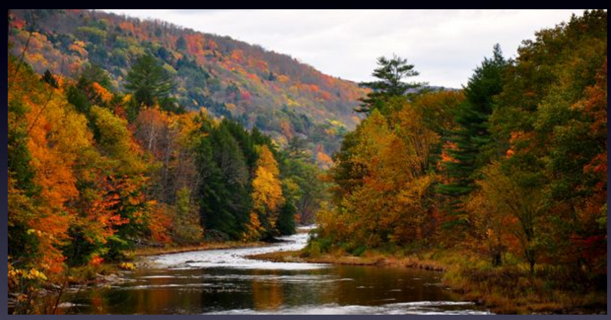
David Yacubian, Ready SF WRMC 2020