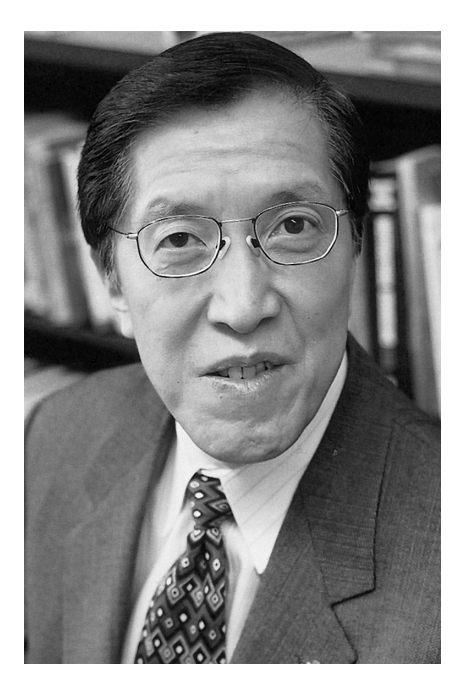
Derald Wing Sue

racial microaggressions has been proposed to explain their impact on the therapeutic process.