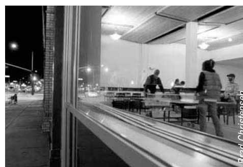
Students relax in the DeSo Commons of the renovated Noble Hotel.

The Noble Hotel, which dates back to 1917, has been used as a temporary home for students and staff and as a permanent space for offices and the school's library. After years of use, it needed a renovation that would meet the needs of a growing and modernizing NOLS community while still respecting 90 years of history. Many of the Noble's historical details, from stained glass to crown molding, have been preserved. Natural light streams through the large windows that line the Noble's exterior and large rooms facilitate gatherings for students and staff. Instructors continued on page 4