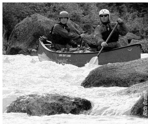
Whitewater canoeing is only one of the skills students learn at NOLS Yukon. Backpacking, mountaineering and, of course, leadership are also part of their curriculum.

"Historically, the Yukon is an area of Canada that has not been well supported by charitable foundations. We are delighted to see our contributions make such a positive impact."