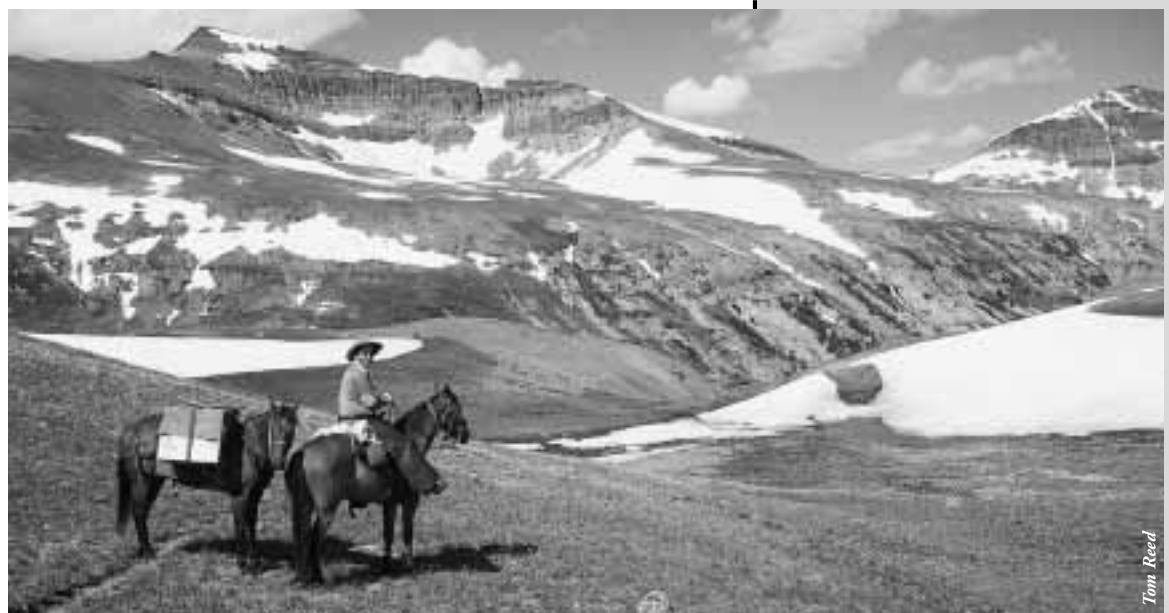
Horses from the NOLS Three Peaks Ranch traveling in the Winds.